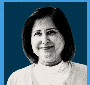
Lt Gov. Ghazala Hashmi

After the 2023 election when five state house districts were lost by razor-thin margins, our team recruited a slate of strong candidates — moms, caregivers, immigrants, veterans, and small business owners who brought the lived experience voters were looking for in 2025.